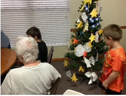
Creating a Dove to remind us of Jesus' Baptism