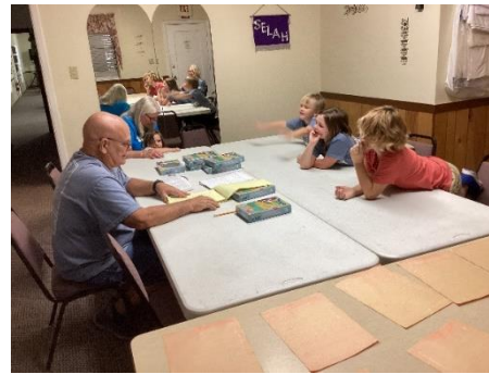
Learning about the Widow's Mite and giving from the heart.