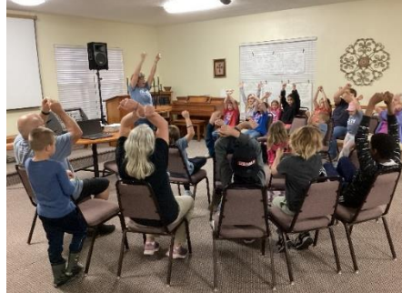
Doing cheers and playing games to help us remember we are also disciples of Christ.