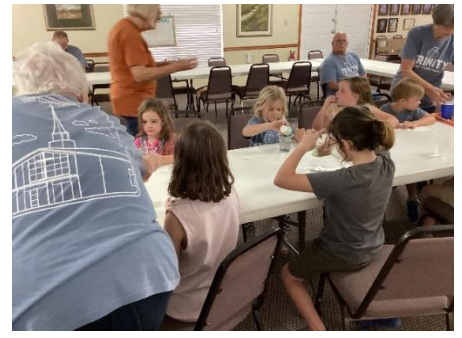
Illustrating Jesus' first miracle by turning water into Kool-Aid.