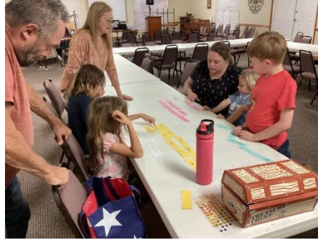
Learning Bible verses