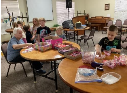
Making Valentine bags to share with the Bread of Life.