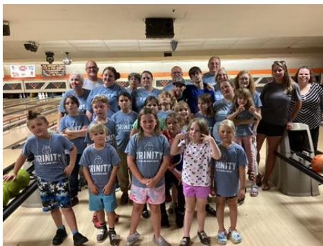
Having fun bowling