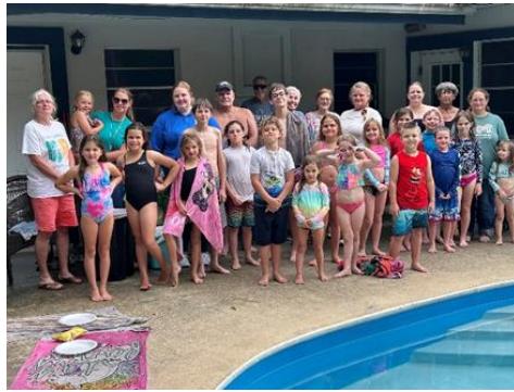
Enjoying God's outdoors at the Reed's pool.