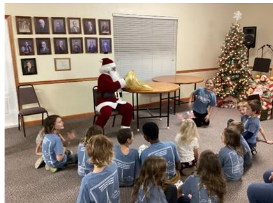
Santa sharing the real meaning of Christmas.