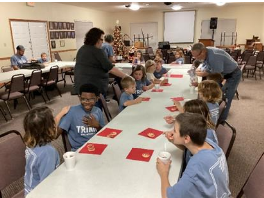
Hot chocolate and cookies after the Hayride