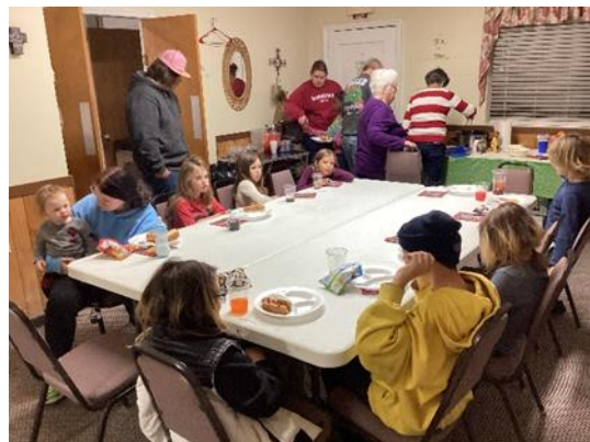
Advent Workshop preparing for Christmas