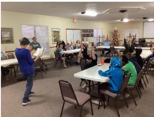
Zacharias and Elizabeth