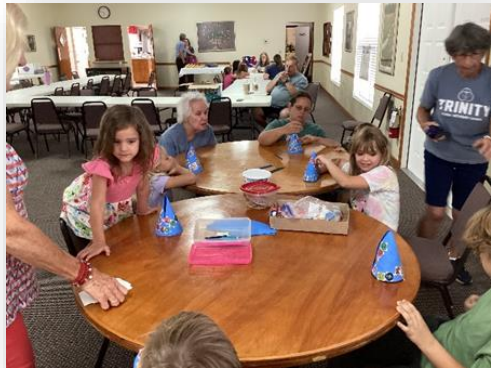
Teamwork and megaphone to encourage others as Barnabas did.