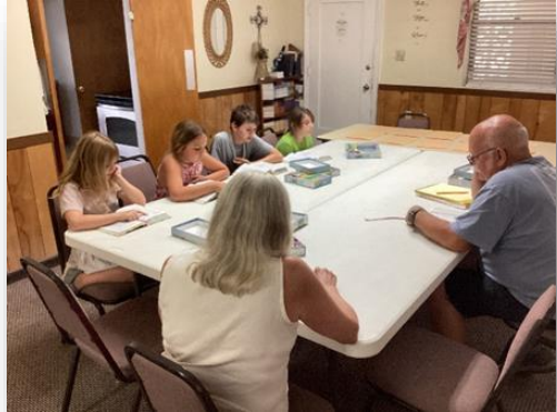
Learning about Paul and how he was changed by on the road to Damascus.