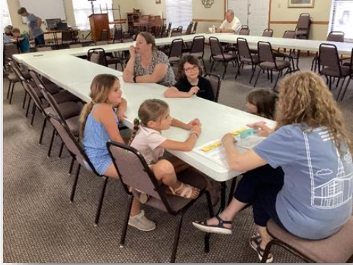
Learning about Philip and the Ethiopian and how we should tell others about Jesus.