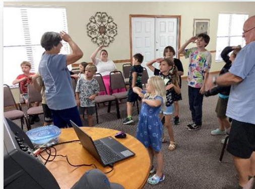
Sharing Jesus love with others as Lydia did.