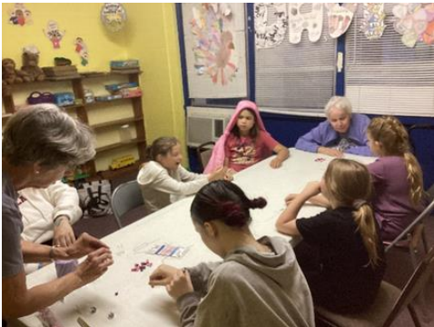
Studying Simeon and Anna as they saw that God keeps His promises.