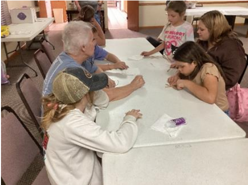
Epiphany and the Wise Men following the star.

January was a super busy month at Kids' Klub. We started back after the Christmas holiday by celebrating Epiphany and learning about the Wise Men. We followed Jesus to the temple when He was eight days old and twelve years old then finished the month with a great snow day. If you are a kid, come and see what blessings God is showing us. We will learn about Jesus, play games, sing, and pray together. Supper will be served each week. We are looking forward to seeing you from 5:00 to 7:00 each Wednesday afternoon.