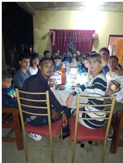
The young people of the area had a Christmas Dinner at the San Antonio del Rio Blanco church which we support with our designated offerings.