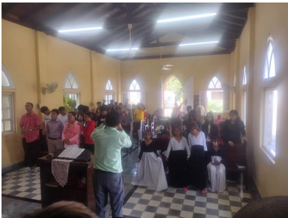
A Sunday Morning worship Service during the Christmas Season.