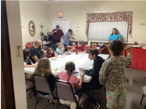
Advent Workshop preparing for Christmas